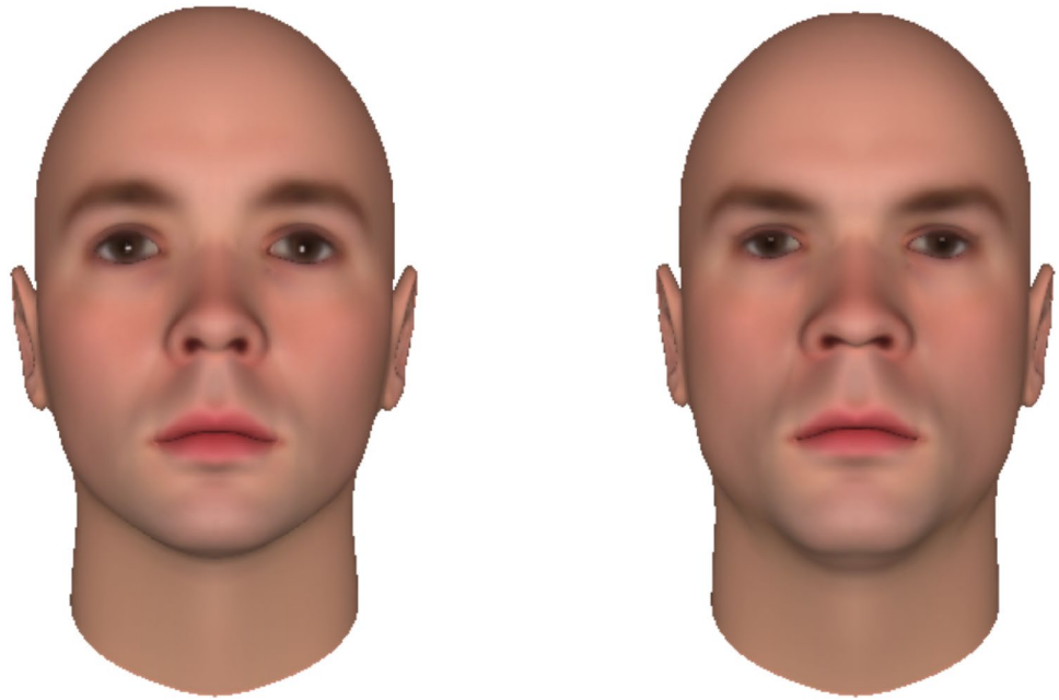
Fig. 1 Examples of submissive (left) and dominant faces (right) used in Study 1 and Study 2. Faces were taken from the Dominance Face Data Set (Oosterhof and Todorov 2008)

taken from the Dominance Face Data Set (Oosterhof and Todorov 2008). This is a stimulus set of 25 different Caucasian male faces with a direct gaze, computer-generated with FaceGen 3.1 software. Two versions of the 25 faces were used; one version 2SD below and one version 2SD above the mean dominance level, representing the submissive and dominant faces, respectively (see Fig. 1 for examples of the face stimuli). On each trial, submissive and dominant faces were randomly selected without replacement from the lists of 25 submissive and 25 dominant faces. Note, however, that the selection without replacement started anew after all 25 faces of the list had been selected. Hence, the same submissive and dominant faces were used in several trials. The variation in dominance is based on facial features, not facial expressions (as was the case in Schultheiss et al. 2005; Schultheiss and Schiepe-Tiska 2013). The fact that the faces were computer-generated modifications was explained to participants as following from the need to maintain potential leaders' anonymity. Hence, the faces were said to closely represent the actual potential leaders' faces, but not literally be their faces.